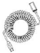
Extension Cord (x 1)