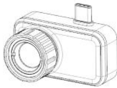
Thermal Imager (x1)