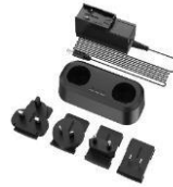
M Series Charging Base HM-5202ZC