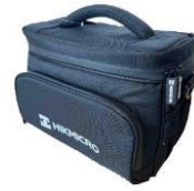
M/G/SP Series Pouch HM-SP01-POUCH

COMPLIANCE NOTICE: The thermal series products might be subject to export controls in various countries or regions, including without limitation, the United States, European Union, United Kingdom and/or other member countries of the Wassenaar Arrangement. Please consult your professional legal or compliance expert or local government authorities for any necessary export license requirements if you intend to transfer, export, re-export the thermal series products between different countries.